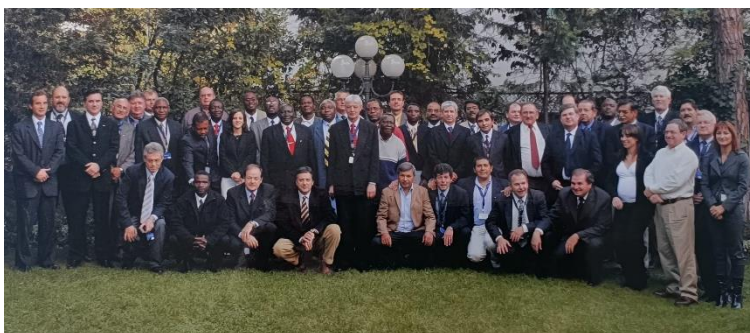
ITGA AGM Italy, 2006