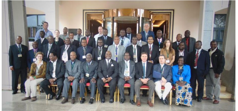
ITGA Africa Regional Meeting Zimbabwe, 2015