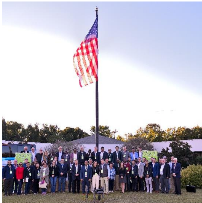
ITGA AGM United States, 2024