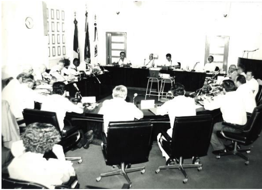
ITGA Foundation Working Table, 1984