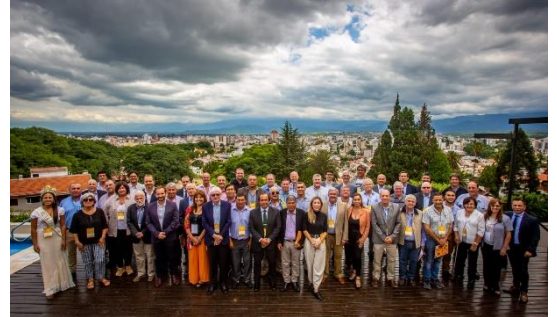
ITGA Americas Regional Meeting Argentina 2023