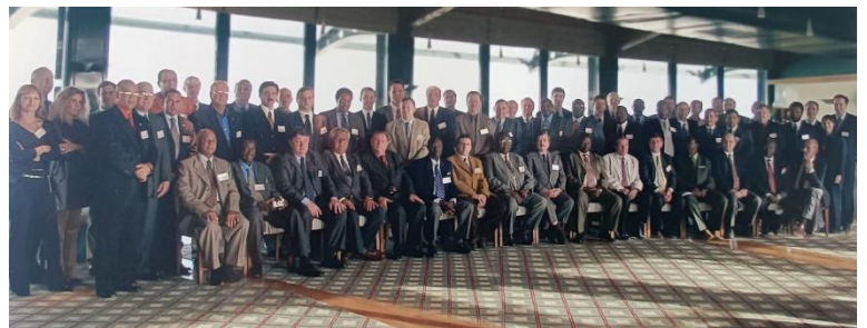
ITGA AGM Portugal, 2002