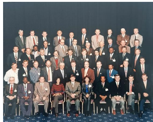
ITGA AGM United Kingdom, 1998