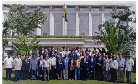
ITGA AGM India, 2009