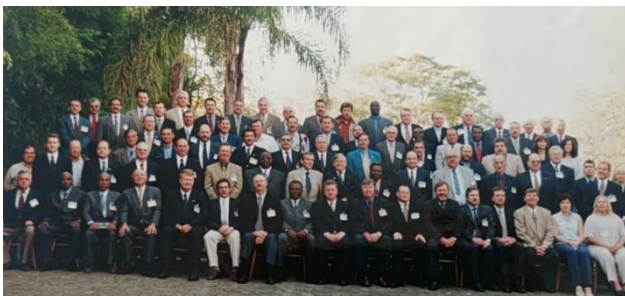
ITGA AGM Brazil, 2000