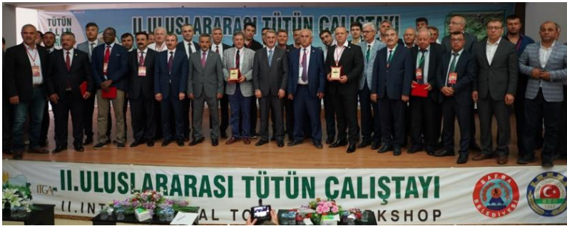
ITGA Regional Meeting Turkey, 2019