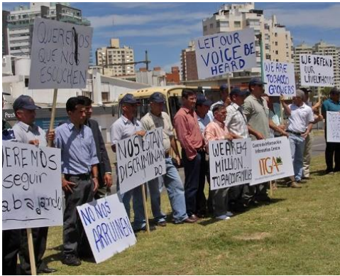
ITGA Tobacco Growers at COP4 Uruguay, 2010