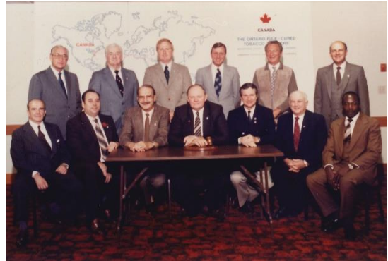
ITGA Foundation in Canada, 1984